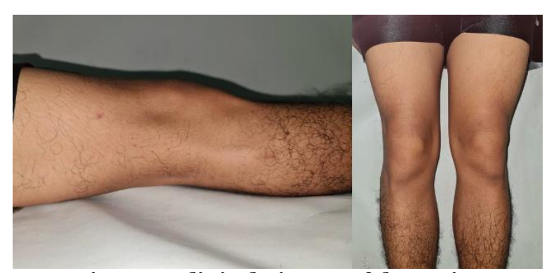
Figure 1. Clinical Picture of the Patient

assessment was 100%. The AOFAS assessment was 90% at 12-months follow-up and the patient presented good ankle motoric power with no complaint regarding the ankle function. The range of motion for both ankle eversion and first ray plantar flexion were not limited. The patient was unstable before surgery on the anterior drawer test, and Lachman's test indicated a score of +3. Post-operatively, the patient had negative results on Lachman's test and anterior drawer test. The patient had no complaint and satisfied with the result by radiograph (see Fig. 5).