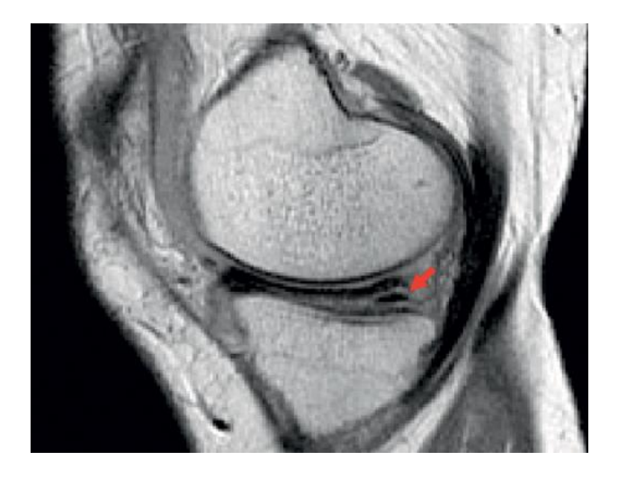
Figure 3. Magnetic resonance imaging of the right knee revealed, T1-weighted sagittal MRI of the right knee visualized medial discoid meniscus with a horizontal tear (confirmed by red arrow)