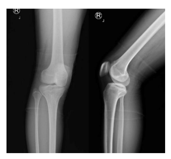
Figure 2. Anteroposterior and lateral standing x-ray of the right knee showed, widening of lateral joint space and increased concavity and subchondral sclerotic of the medial tibial plateau.