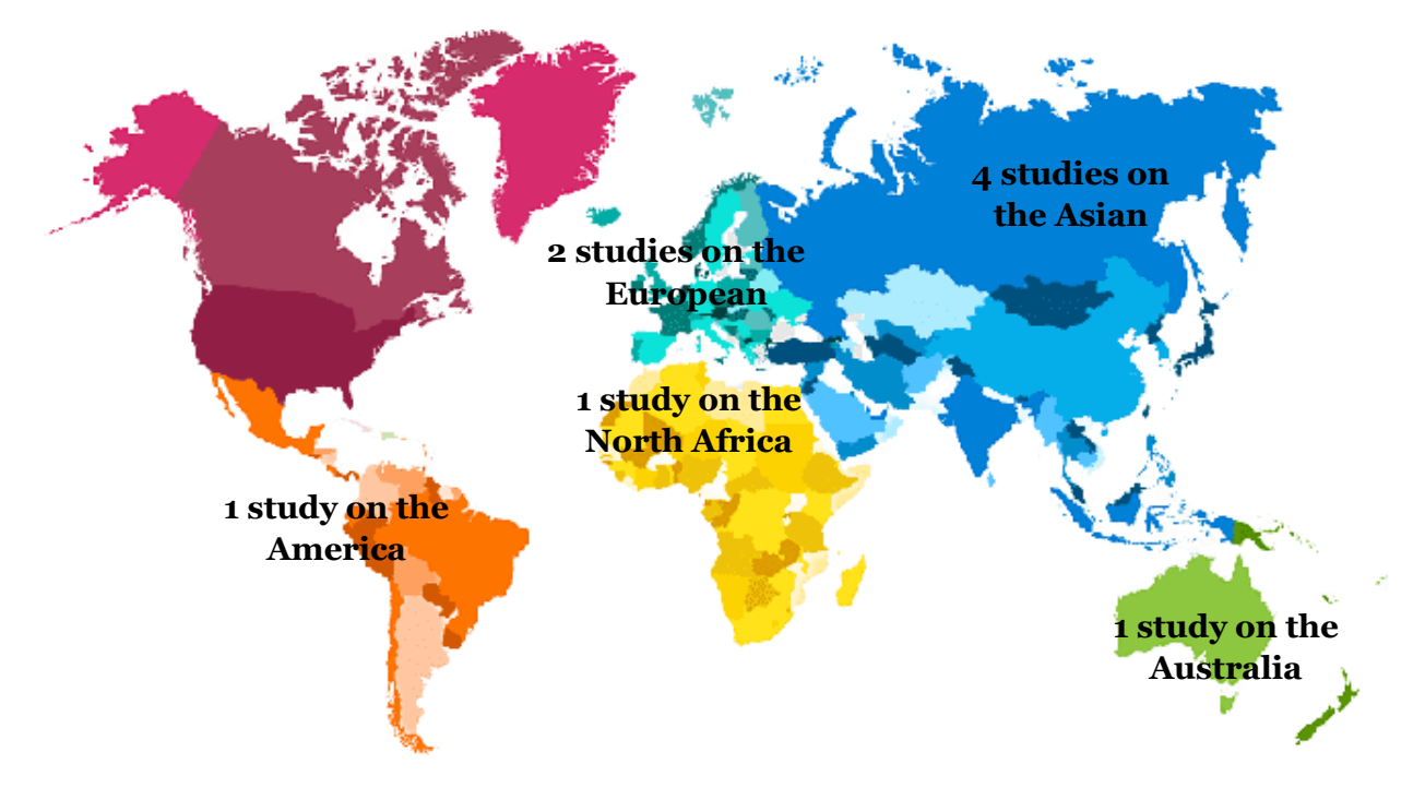
Figure 2. Study Map Area Effect of Aquatic Therapy on Functional Ability in Patients with Knee Osteoarthritis