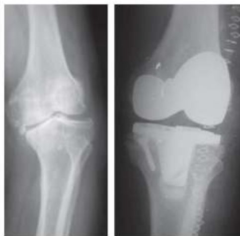
Picture 3. Screw augmentation in patient with knee osteoarthritis with tibial defect(Rajesh, 2012)