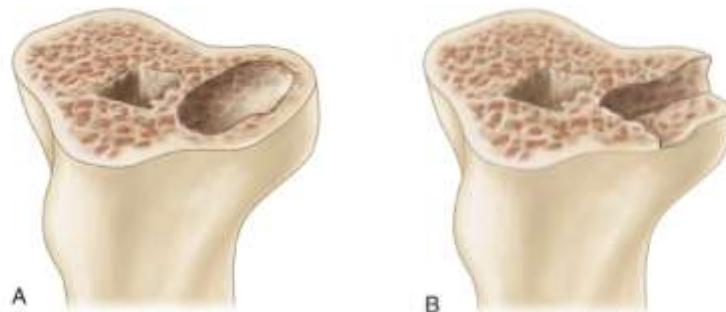
Figure2. (A) Contained; (B) Non-contained(Rajesh, 2012)

Large (>10 mm) – structural allograft or modular augmentation